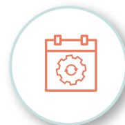
Fewer Routine Service Calls