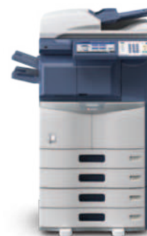
e-STUDIO456 with 50-Sheet Inner Finisher and Hole Punch.