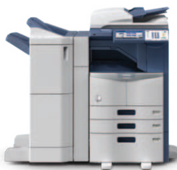
e-STUDIO456 with 2,000-Sheet LCF, Hole Punch, and 50-Sheet Staple Console Finisher.