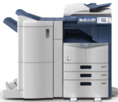
e-STUDIO456 with 2,000-Sheet LCF, Hole Punch, and Saddle-Stitch Finisher.