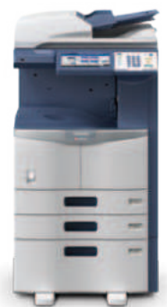
e-STUDIO456 with 2,000-Sheet LCF.