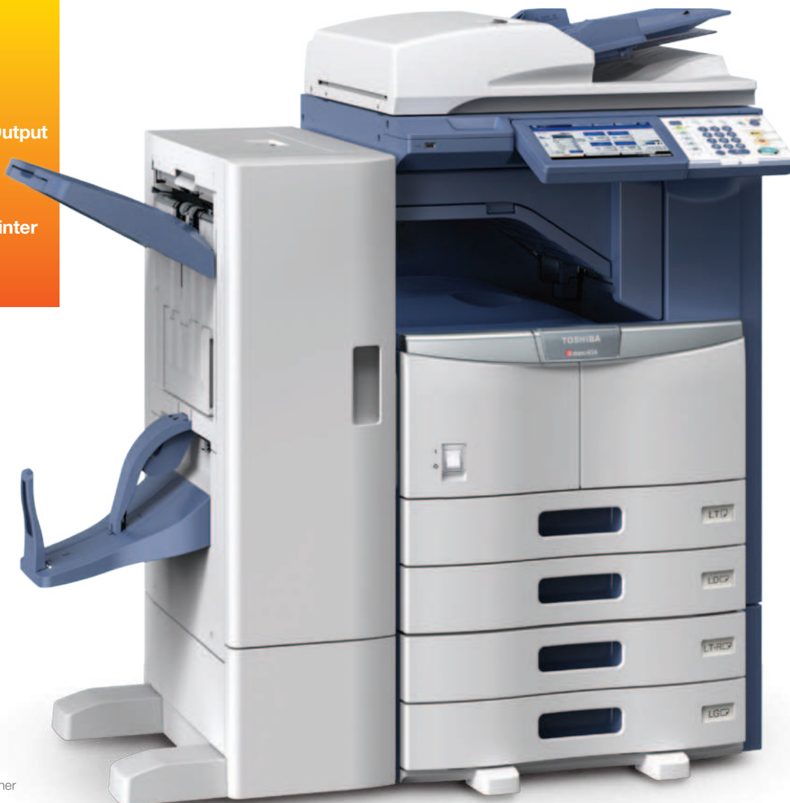
e-STUDIO456 with Saddle-Stitch Finisher